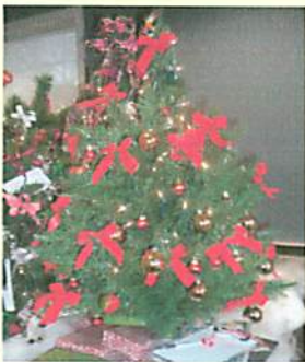
Decorated by Library Loft

Next year, why don't you decorate a tree for the silent auction? We provide the tree and lights – the rest is up to you! You choose a theme and decorate your tree as creatively as you like. See the trees and get some ideas at our website: www.topfloorlearning.org